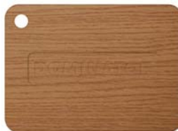
▲ Cedar Steel*