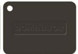
▲ Iron Sand