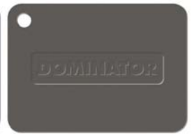
▲ Slate Grey