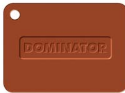
▲ Pioneer Red