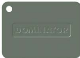
▲ Bond River Gum