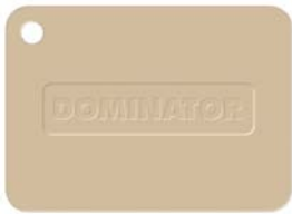
▲ Desert Sand