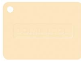
▲ Smooth Cream