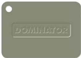
▲ Mist Green