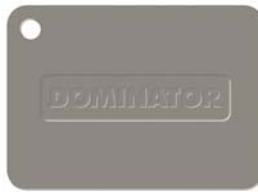
▲ Sandstone Grey