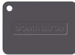
▲ Grey Friars