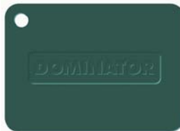
▲ Permanent Green