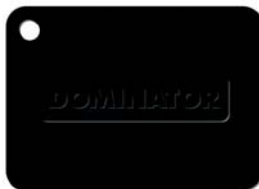
▲ Pitch Black