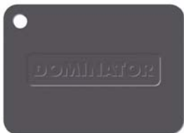
▲ New Denim Blue